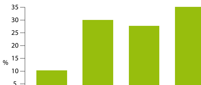
Figure 1: Council graffiti removal response times