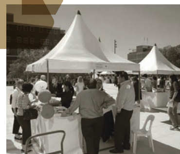
During Law Week more than 50 events were held at 22 locations across the state.